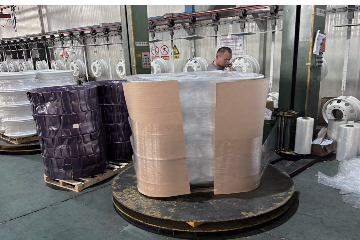
Automatic Packing Machine