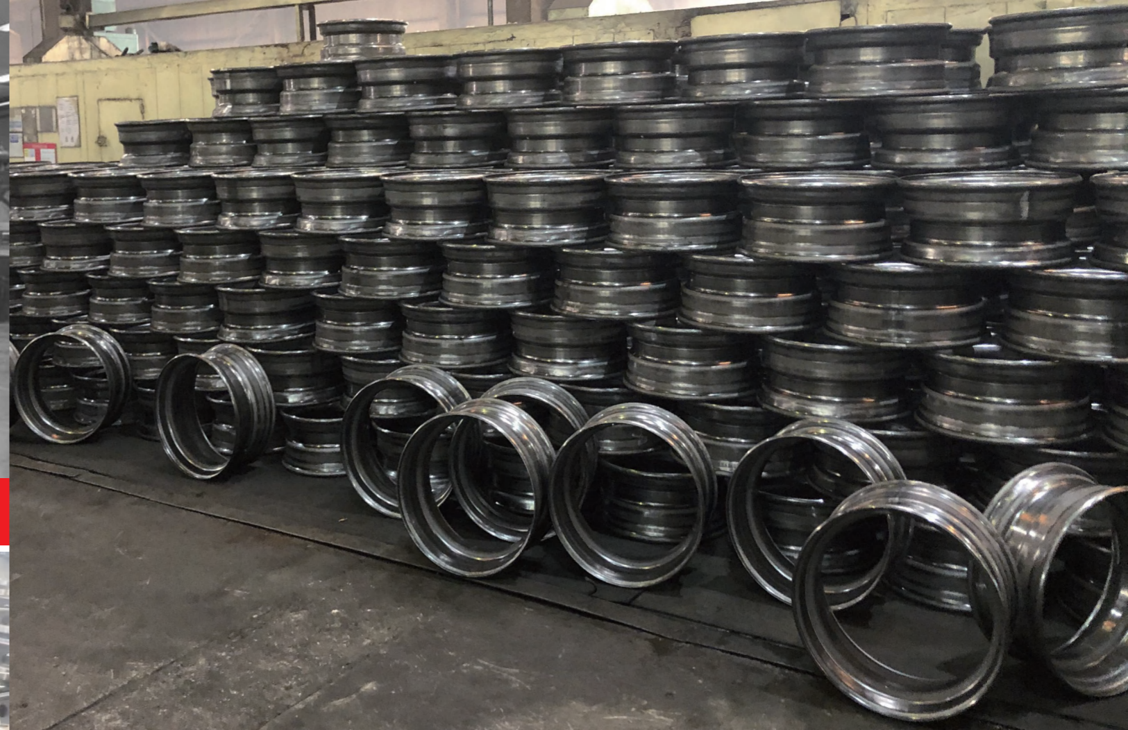
Roll Forming Rim