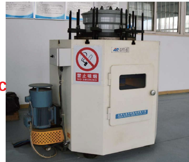
Bending Fatigue Testing Machine