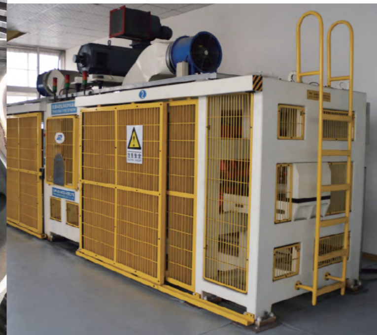
Radial Fatigue Testing Machine